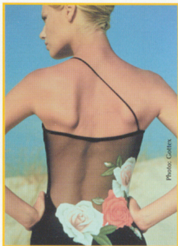
Spanish Rose from Gottex.